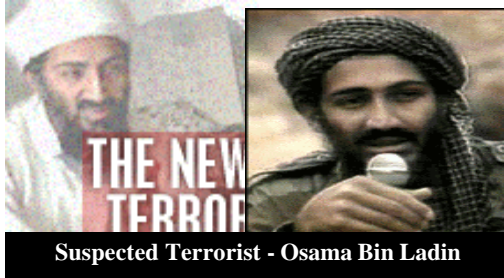
Suspected Terrorist - Osama Bin Ladin

We are NOT Terrorists!! - We may have a similar appearance to those responsible for the attack on America, our beliefs, our faith, our love for God and our fear of God make us totally DIFFERENT people. Sikhs are NOT part of this network. Sikhs DO NOT promote fundamentalism. American SIKHS love their home and their AMERICA.